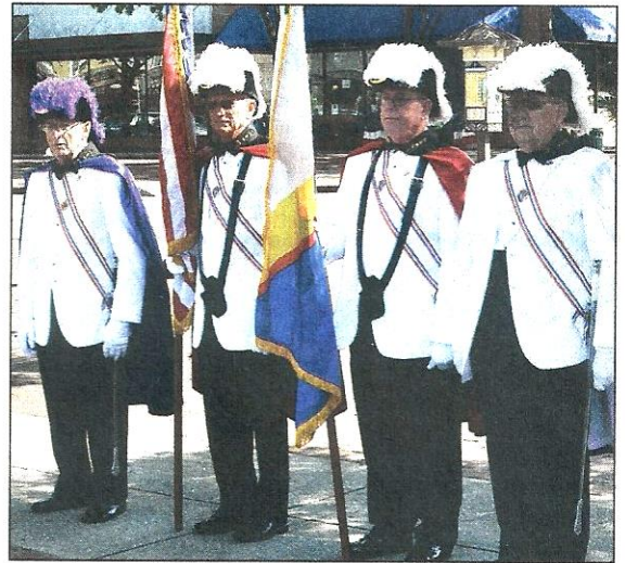
Knights of Columbus color guard was present.

The Georgetown American Legion Post 114 and the Georgetown Veterans of Foreign Wars Post 6444 conducted a Memorial Day ceremony today at Francis Marion Park on Front Street.